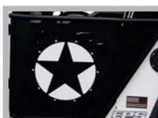
NEW STYLE IRON DOOR PANEL