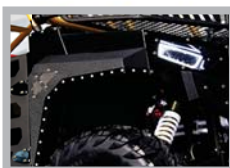
CUSTOM FENDER FLARES