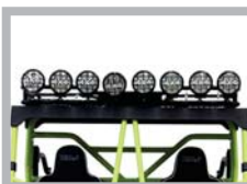
8X LED ROOF LIGHTS