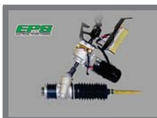
ELECTRIC POWER STEERING