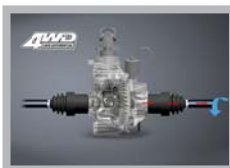
ON-DEMAND LOCK DIFFERENTIAL