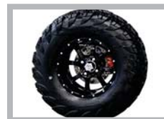
PREMIUM RIM & TIRE