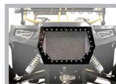
HARD ROOF DECK