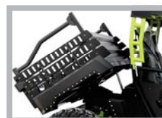
ELECTRIC DUMP BED