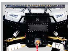
CUSTOM FRONT BUMPER