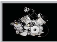
81HP 1000CC V-TWIN ENGINE