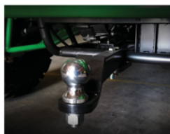
REAR HITCH BALL