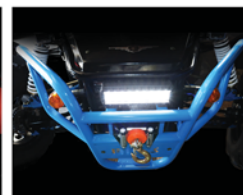
LED AUXILIARY DRIVING LIGHT