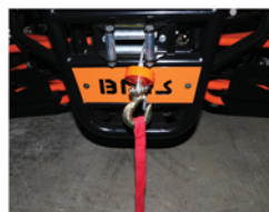
FRONT WINCH 3,000LBS CAPACITY