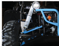
LONG TRAVEL SUSPENSION