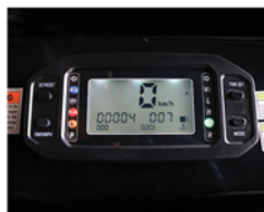
DIGITAL INSTRUMENT CLUSTER