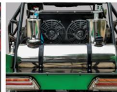
LARGE CAPACITY GAS TANK