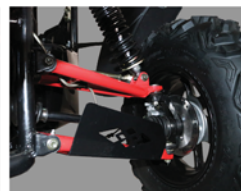
FRONT & REAR HYDRAULIC DISC BRAKES