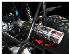
HIGH PERFORMANCE EXHAUST