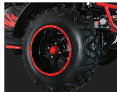
PREMIUM RIM & TIRES