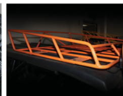
ROOF CARGO RACK